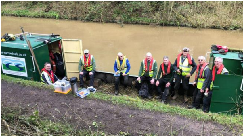
A workday on the canal for the Braunston Canal Society (see pages 34—35)