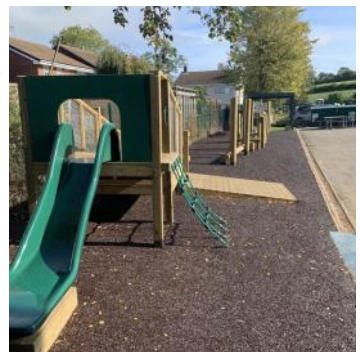
Braunston Canal Society have answered our plea to come and restore the boat on the Key Stage 1 playground and have painted it in bright colours, fixing the seating area and making it safe to play on for years to come. We are

busy thinking of a name for the boat and will share the winning entry soon.