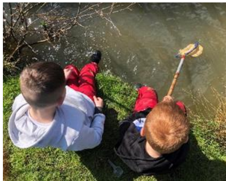
Year 4 pond dipping

Swimming for Reception, Year 1 and Year 6 started on Monday 15 th May. The pool continues to be lovely and warm despite the ever-changing weathers that we are experiencing. The children continue to delight in their experiences of our outdoor pool.