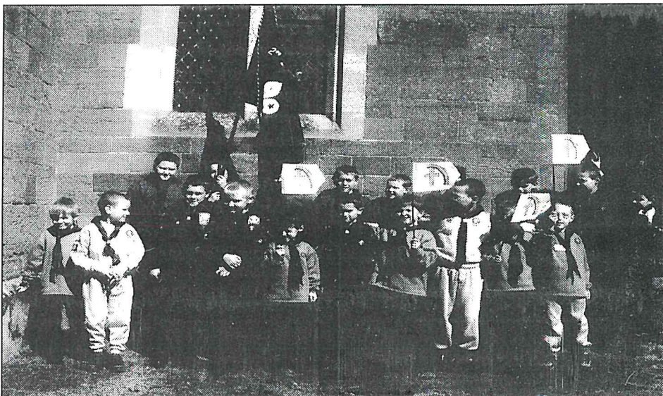
At the Family Service on 20 th April the new Scout Flag was dedicated. The Scouts would like to thank the generous donor for the gift of the new flag.