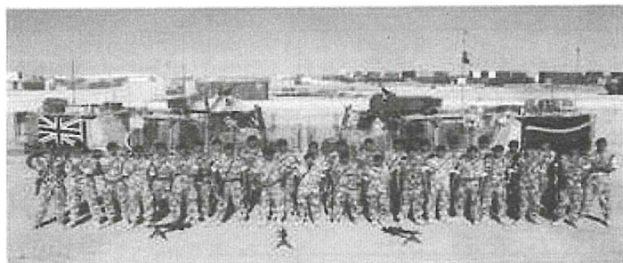
From all the Lads and Girl of 1 Troop Royal Marine Armoured Support Company