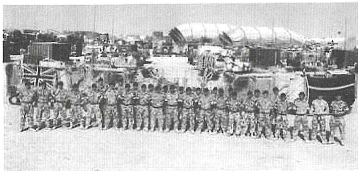
From all the Lads of 2 Troop Royal Marine Armoured Support Company