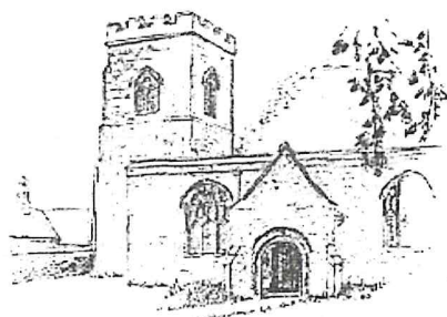
The Blessed Virgin Mary & St Leodegarius, Ashby St Ledgers